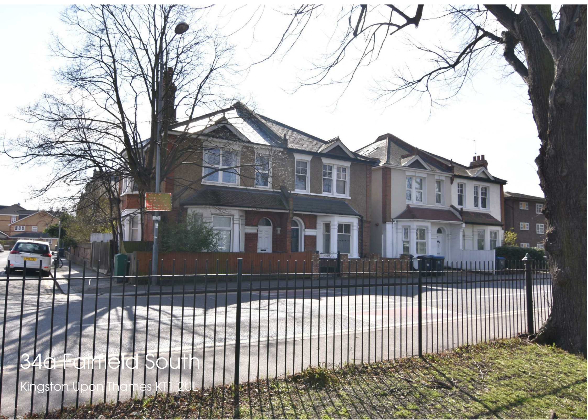
34a Fairfield South Kingston Upon Thames KT1 2UL